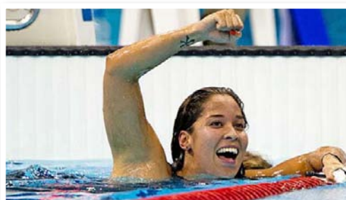
Ranomi Kromowidjojo (2011)