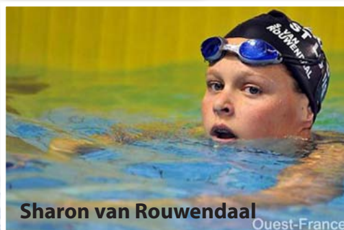
Sharon van Rouwendaal