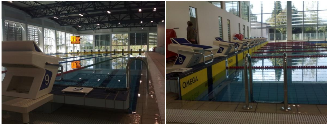
The new indoor Olympic Swimming pool in Banja Luka

Organizer of the 3 th International Swimming Championships “Banja Luka Open 2010” is Swimming Club Olymp, Banja Luka, Republic of Srpska, Bosnia and Herzegovina